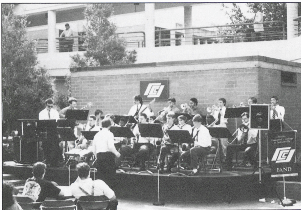
FCCJ Jazz Band performs on the outside stage at South Campus.