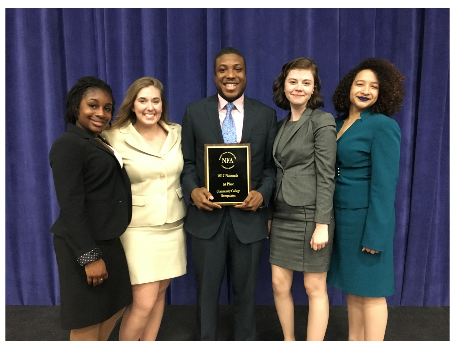
FSCJ Forensics Team Wins National Title

★ / Bluewave News / BlueWave News June 2017