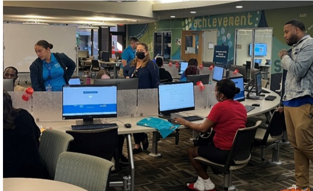
Kent Campus Imagine Your Future

Thank you to everyone who came out and supported our recent Imagine Your Future events. We had more than 160 students attend across the four days. This was a great opportunity for future students to learn more about our programs and receive hands-on assistance with our application, FAFSA and scholarships. We look forward to hosting more events soon!